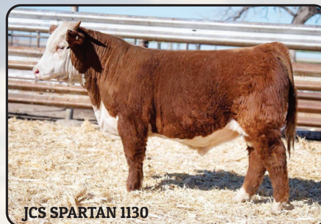
JCS SPARTAN 1130