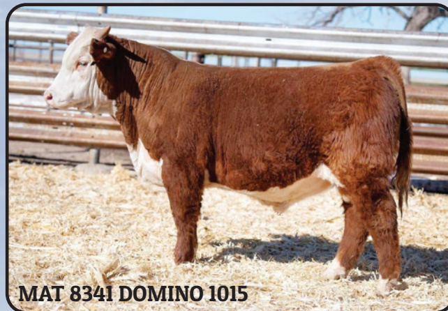
MAT 8341 DOMINO 1015