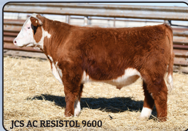
JCS AC RESISTOL 9600