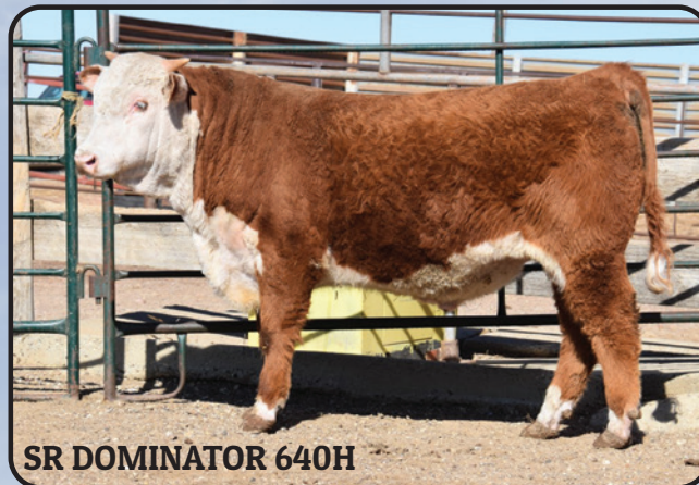
SR DOMINATOR 640H

Highlighted boxes indicates Trait Leader.