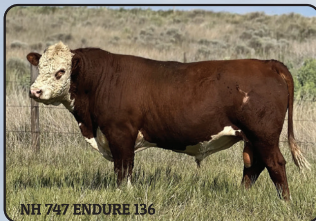
NH 747 ENDURE 136