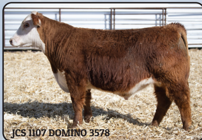
JCS 1107 DOMINO 3578