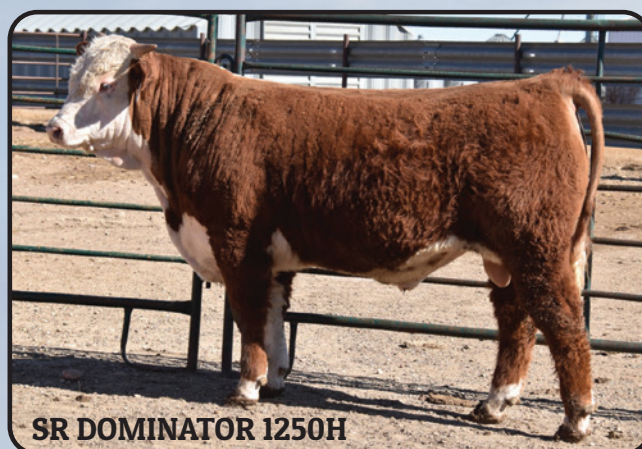
SR DOMINATOR 1250H